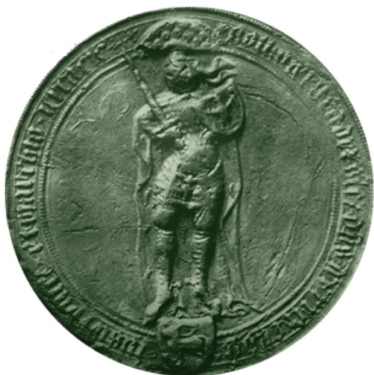
2 Seal of Bolko II (c.1365–8)

A more direct point of contact between Machaut and Peter, declared the head of the crusading project following John's death, was during the coronation of Charles V in Reims in May 1364 which both men attended. The notion of a meeting is strengthened by the changing character of the description of Peter in the Prise from this point on. 38 The complaint Mon cuer, m'amour ma dame souverainne (Cp6), mentioned above, was likely composed shortly after this event, perhaps even handed over to Peter in time for the resumption of his travels. At this point, Peter must have been planning his visit to the Holy Roman Empire, as he embarked upon it shortly after the tournament in honour of the new French king was over. A song such as B30, Pas de tor , praising the recent achievements of the Holy Roman Emperor Charles IV and his powerful father-in-law Bolko II might have come in useful for Peter. As a descendant of a French dynasty ruling over a kingdom with strong Venetian connections, the Romance West offered