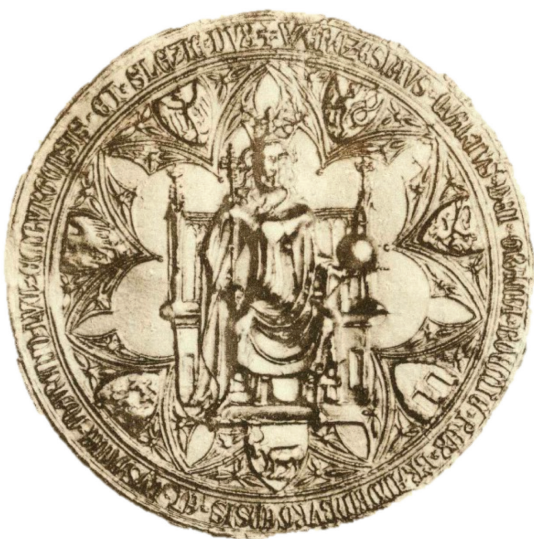
3 Seal of Wenceslas IV (25 July 1363), the first to depict the Lusatian coat of arms

him more personal and cultural access points than the Germanic East. Even if we assume no direct contact between Machaut and Peter, their respective roles as high-ranking official in the coronation's host institution and royal guest associated with the celebrations would have placed them in close enough proximity to pursue joint interests, perhaps via intermediaries. After all, Machaut was highly regarded by the new French king, who already possessed a Machaut manuscript and had visited the author's home in Reims in 1361. 39 Both from the poetry and through his mother, Charles would have been well aware not only of Machaut's artistic prowess, but also of his links to the Luxembourg dynasty. From Machaut's side, Cp6 attests to him being amenable to supporting Peter; various passages in his oeuvre demonstrate vivid memories from his time spent in the service of the Luxembourgs; and not much time had passed since B33, Nes que on porroit ('No more than a man