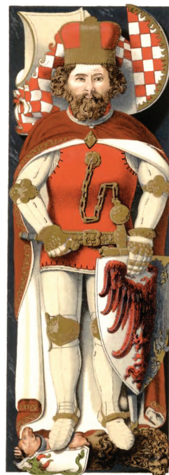
4 Effigy of Bolko II, St Mary's abbey church, Krzeszów / Grüssau (image by Edward Knapczyk). Note the position of the Lusatian arms in relation to those of his other acquired territories. The current, erroneous colourings (and 19th-century 'improved' polychrome on the right) of the coat of arms are the result of 18th-century reconstruction work.