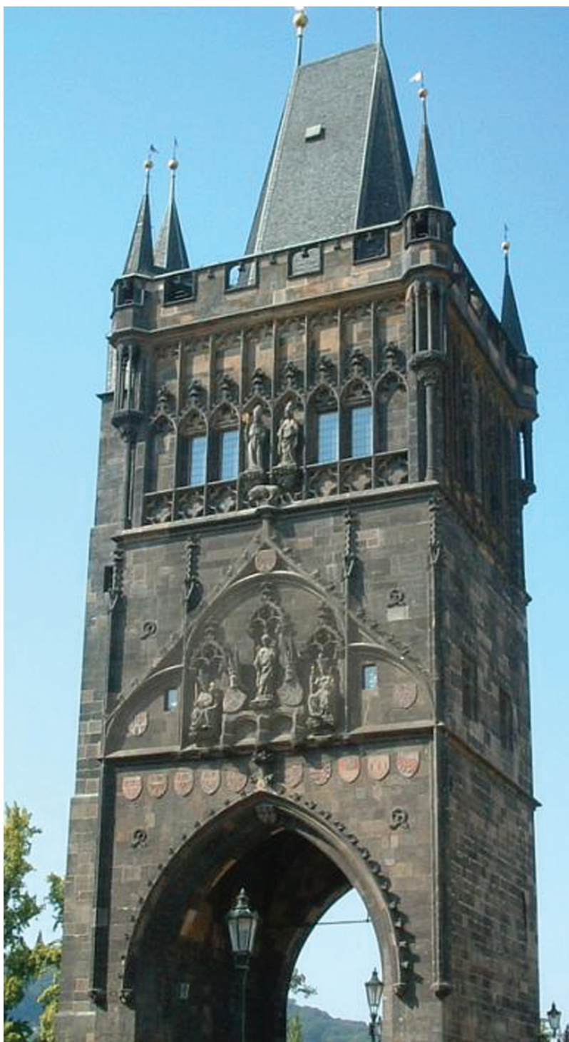
5 East façade of the Old Town Tower on Charles Bridge, Prague, presenting the earliest coloured version of the Lusatian arms (at the far right, c.1368–73)